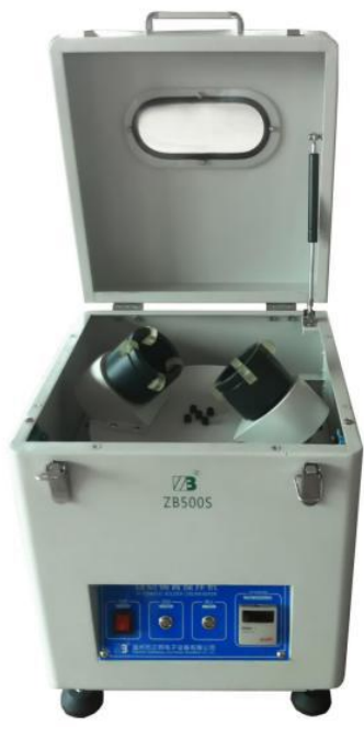
Step 2: Take out solder paste with the bushing (Tips: The bushing is not required if the diameter of the solder paste is larger than \Phi 64), and take out the 500g balance code