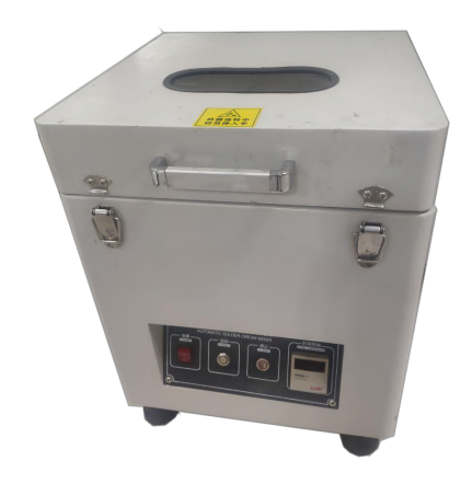
Step 5: Set the mixing time to reference 15 minutes (Tips:H is seconds, M is minutes, S is seconds), Time controller interface: set to 15M00